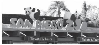
1 ..... ZOO .....